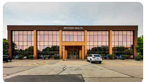
Reach's Office is located on the 3rd floor.