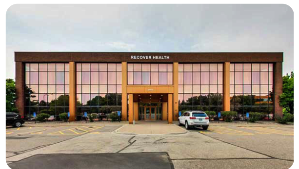
Reach's Office is located on the 3rd floor.