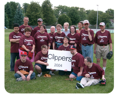
One of three Adaptive Rec softball teams in the summer of 2004.

Join us throughout the year as we honor our past, celebrate our present, and look forward to a future filled with continued growth, connection, and impact.