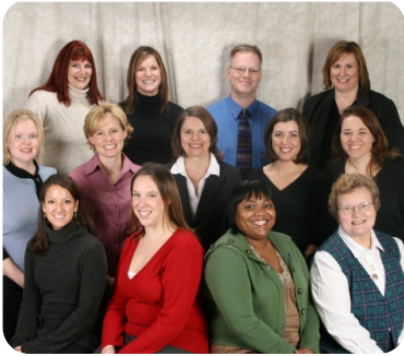
Staff photo from 2005.

This milestone is more than just a reflection of time, it's a celebration of the thousands of lives that have been touched by Reach's dedicated team, compassionate volunteers, and generous supporters. It's a testament to the power of inclusion and the belief that everyone deserves the opportunity to reach their fullest potential. Over the past 40 years, Reach has expanded its services to meet the changing needs of the community, from inclusive recreation programs to personalized mental health support. Our commitment to innovation and adaptability has allowed us to remain a vital resource for individuals and families alike.