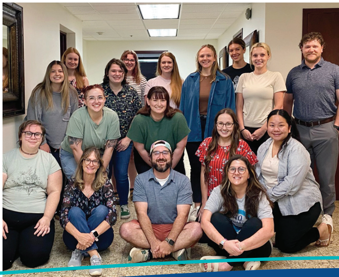
Waiver Case Management Team